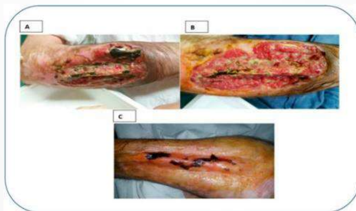
Figure 1. (A) Skin lesion at admission, with consistent tissue damage and bone exposure. (B) Lesion cleansed. (C) Wound after treatment with platelet rich plasma + platelet poor plasma. The patient referred that he refused the plastic surgery for tissue reconstruction and, during the home stay, he used acetaminophen and NSAIDs (ketoprofen, ketorolac, ibuprofen) for pain management without clinical improvement. The skin of the forearm was red with signs and symptoms of infection (fever 38.2°C); the bone, tendons, and muscle were exposed. Interphalangeal joint flexion and extension of the last three fingers was not possible. Blood pressure was 120/78 mmHg, heart rate was 85 beats/min, and oxygen pressure saturation at room temperature was 99%. Plain radiographs excluded the presence of bone fracture but revealed a severe soft tissue edema.

Methods: A 37-year-old man presented to our ward of pain medicine for an accidental severe leg injury associated with skin and soft tissue loss ( Figure 1A ).