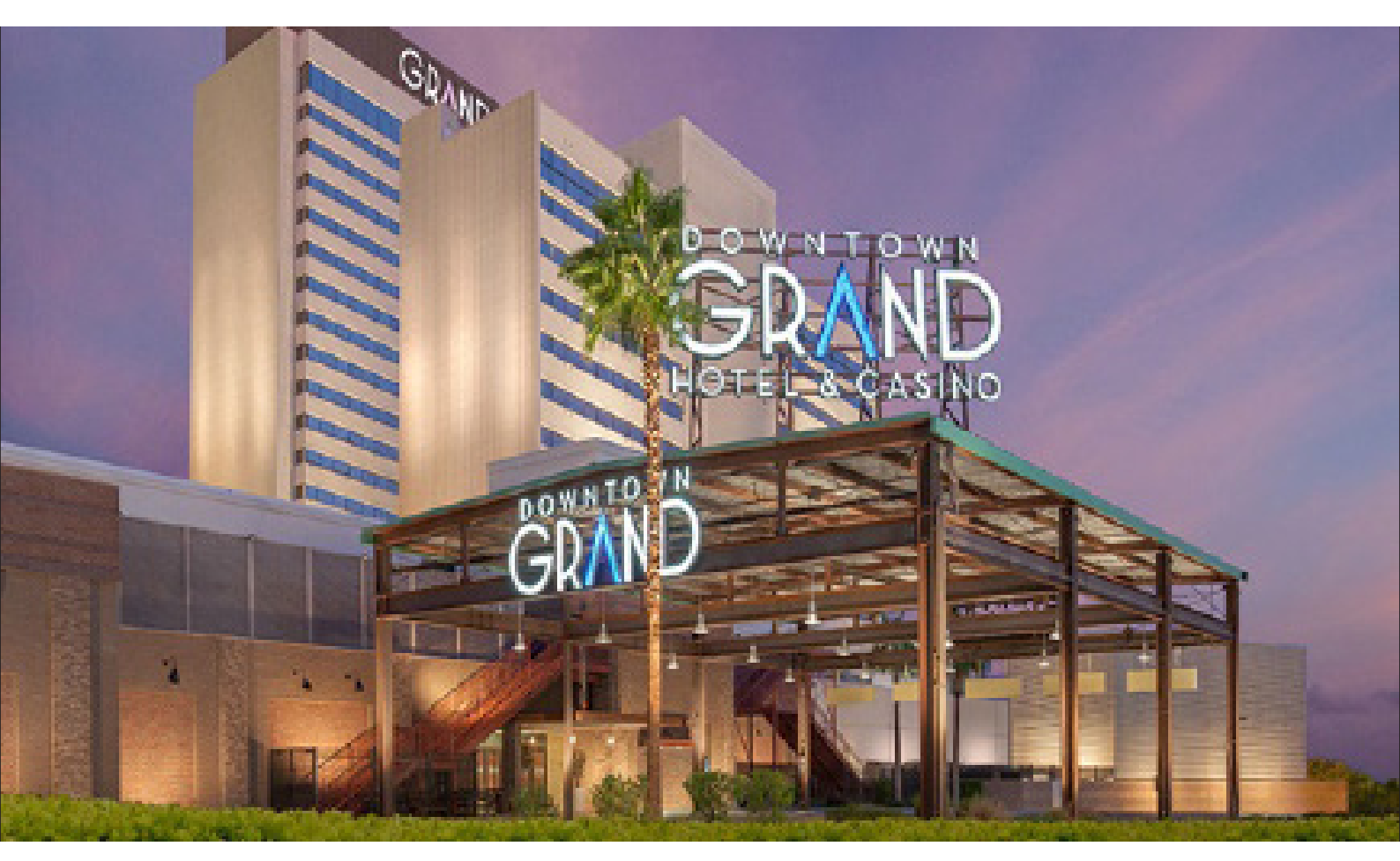
Venue: Downtown Grand Hotel, Las Vegas, USA

For General Inquiries/Exhibition/Sponsorship/Advertising mail us at: E-mail: epidemiology@researchersgatherings.com